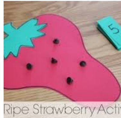
Ripe Strawberry Acti

You can find a copy of the story on YouTube and listen to it.